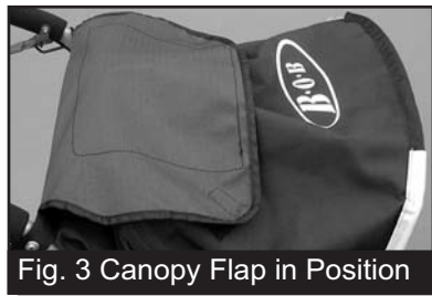
Fig. 3 Canopy Flap in Position