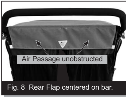
Fig. 8 Rear Flap centered on bar.

Hand wash cold and hang dry. Do not dry clean, iron, or place in dryer.