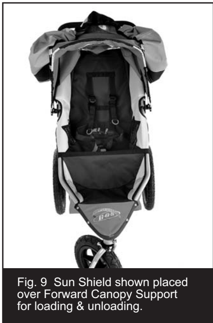
Fig. 9 Sun Shield shown placed over Forward Canopy Support for loading & unloading.