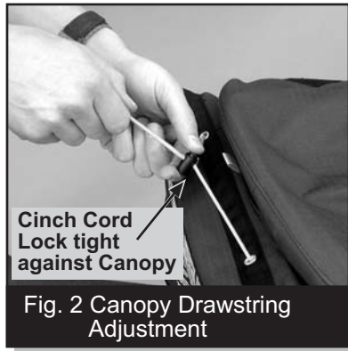
Fig. 2 Canopy Drawstring Adjustment