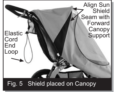
Fig. 5 Shield placed on Canopy

7. Attach each looped end of the elastic cords (protruding out sides of back flap) around each black shock knob on respective