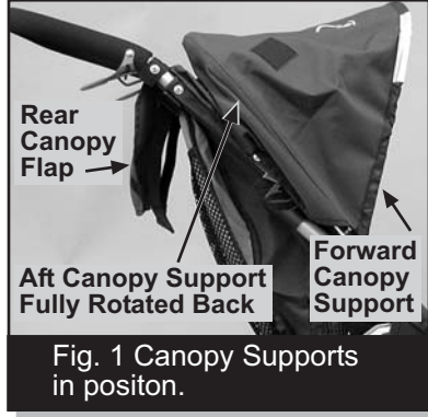
Fig. 1 Canopy Supports in position.