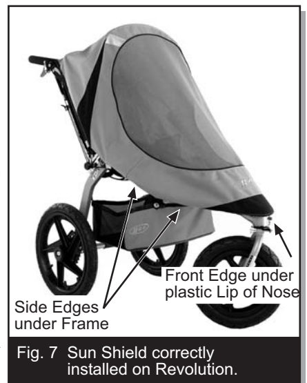
Fig. 7 Sun Shield correctly installed on Revolution.