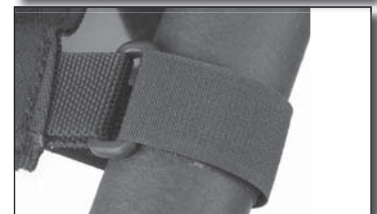
Fig 4 Velcro Strap Secured