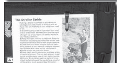
Fig 5 Exercise Manual in Clip