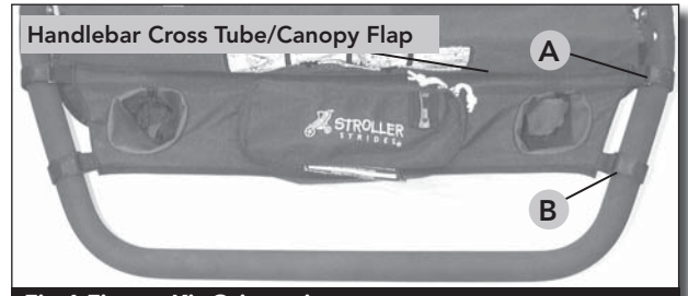
Fig 1 Fitness Kit Orientation