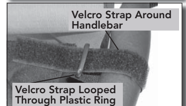
Fig 3 Velcro Strap Routing