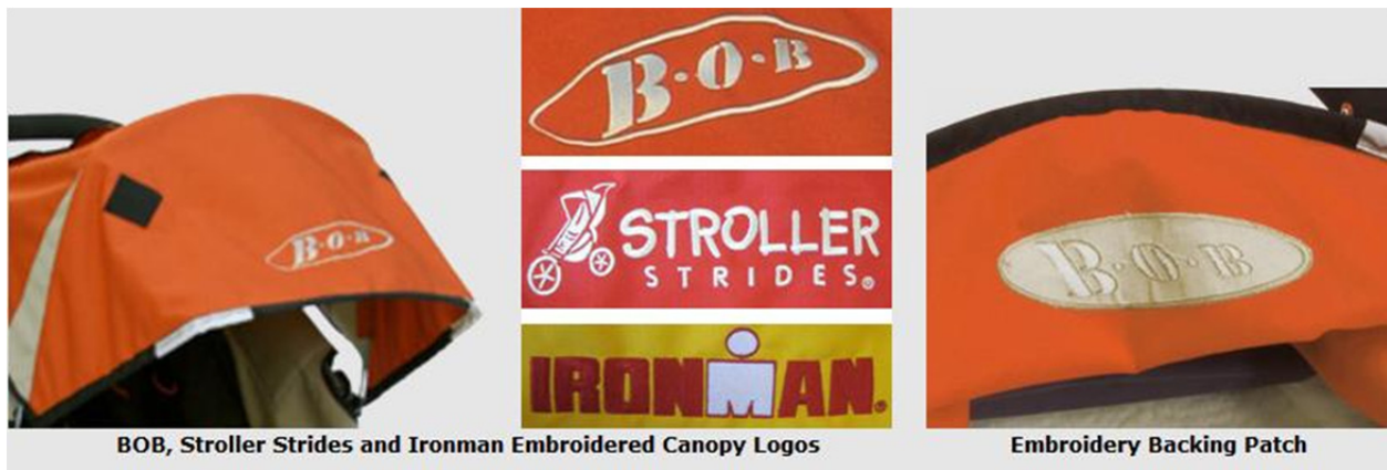
BOB, Stroller Strides and Ironman Embroidered Canopy Logos

The "BOB®," "Ironman®" or "Stroller Strides®" brand name is embroidered on the canopy of the strollers. (see photos below).