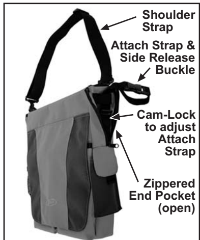
Fig. 1 Diaper Bag direct attachment features.