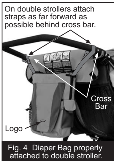
Fig. 4 Diaper Bag properly attached to double stroller.

minimum weight of 10 lb. Fasten stroller Seat Safely Harness to secure the child before attaching Diaper Bag. See "Seat Safety Harness" section of your BOB stroller Owners Manual.