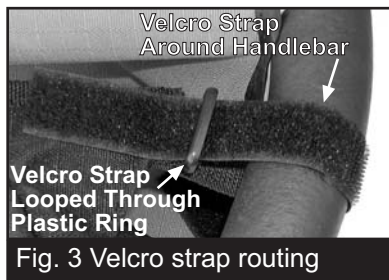
Fig. 3 Velcro strap routing

2. The Handlebar Console attaches to the stroller handlebar by 4 velcro straps. Start attaching the Handlebar Console to the handle bar with the forward right velcro strap, "A" in figure 1. The strap attaches as follows: